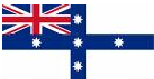
Australian Federation Flag. Australia's First National Flag, 1901-1903

Well, I think anyone who studies demographics and world history, can see it. There's no question that the white race, the characteristics of the genetic makeup of our Con't p. 2