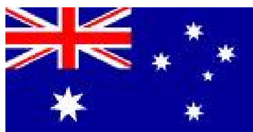
Australian National Flag.