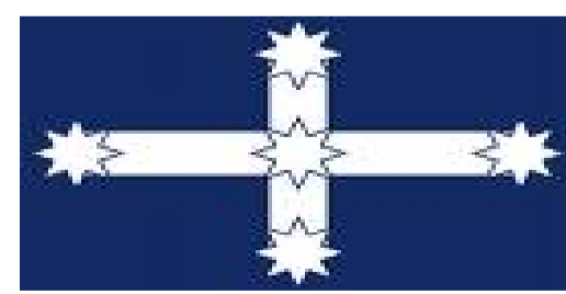
Eureka Flag. Or Southern Cross