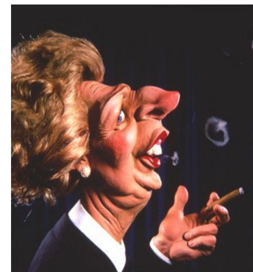
Baroness Thatcher:: the swindling sow who flooded Britain with unassimilables!

This time, Australians aren't going to allow the Liberal Party to screw them, with or without a con dome !