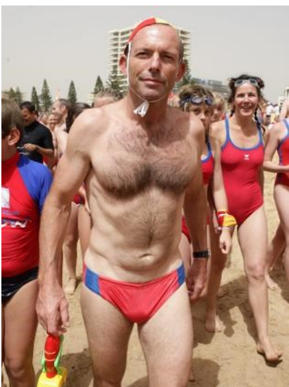
The Abbott in his new habit: just another lying crud with his snout in the trough.

The Liberal Party has played this game before. It is part of a routine brought out to cripple the critics.