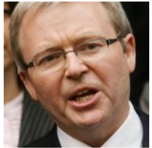
A corker of a porker. Pigs do fly—just ask Kevin 747

This is traditional indeed to oriental cultures, but the methods can seem inscrutable to naive Westerners.