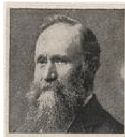
William Guthrie Spence 1846—1926

'Twas of such stuff the men were made who saw our nation born, And such as Lalor were the men who