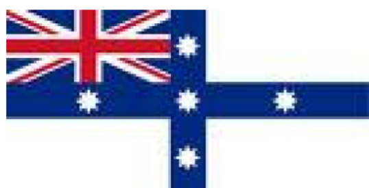
Australian Federation Flag. Australia's First National Flag, 1901-1903