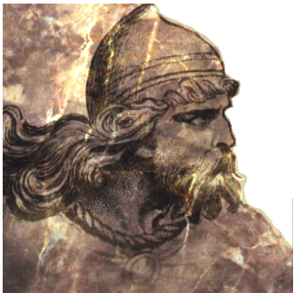
Hereward The Wake — Resistance leader

For expressing such views, The Diggers leadership were beaten, arrested and killed. State power in England – and by extension, later in Australia – remained fearful of challenges to its authority and loyal to ideas that are foreign to – and rejected by – the nation’s people. The Norman Yoke is still with us today.