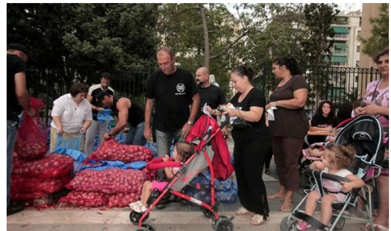
Golden Dawn giving food to needy Greeks

As the private banks also sell these mortgages for ready cash instead of waiting many years, they are able to loan out to more in housing