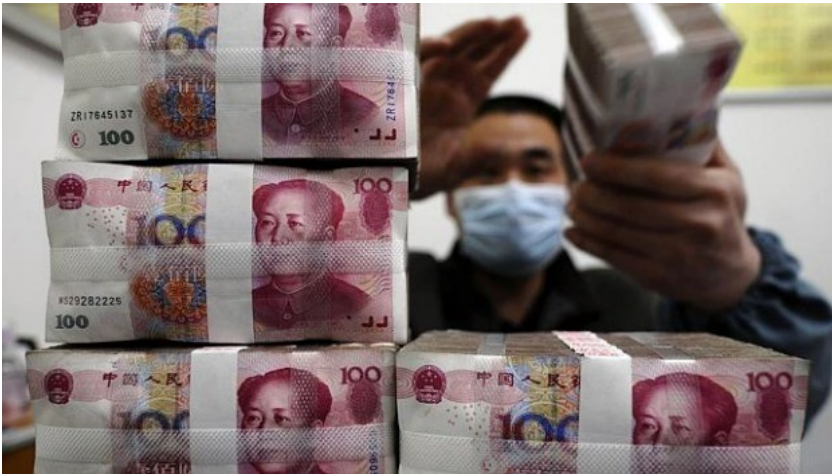
Vast reserves of Chinese capital, the product of exports to America, now get value—Aussie homes, lands, resources.

As most of my readers know the government already has the power to issue its own money. This comes from the Australian Constitution, Part V section 51 subsections 4, 12, 13 ,20, 31. As for the application of interest or excessive charges this also has been established as a fallacy in Australian law, as established by the Royal Commission into Banking and Monetary Policy of 1937. The findings of this Commission had to refer to the presiding Justice Napier who had to interpret what was revealed: “This statement means that the Commonwealth Bank (at that time this bank was the central bank of Australia in the