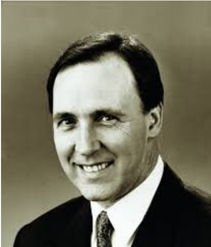
Paul Keating: paid well, worth $60 million.

As none of this activity is helpful for the continuance of Western lifestyles based on an adequate income to meet rising cost of living, often there is no prospect for high paid work in the future. The predictions of economic collapse or failure can therefore