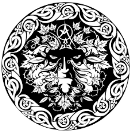
Pagan, Indo-European deity, the Green Man. Commonly found throughout Europe and who inspired Robin Hood style myths.

If Greece ultimately ‘defaults’, so should we. It is the beginning of freedom.