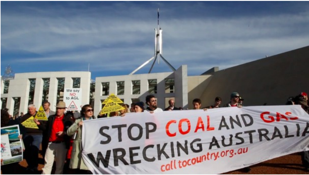
Multinationals destroying Australian farmland by for export products:is the monestising of Australian debt. There is mass resistance.

Thus the direction of technical advancement will be determined only by corporations for profit. The effect of this is already being felt where genetically modified foods are destroying the organic natural and safe food production, where