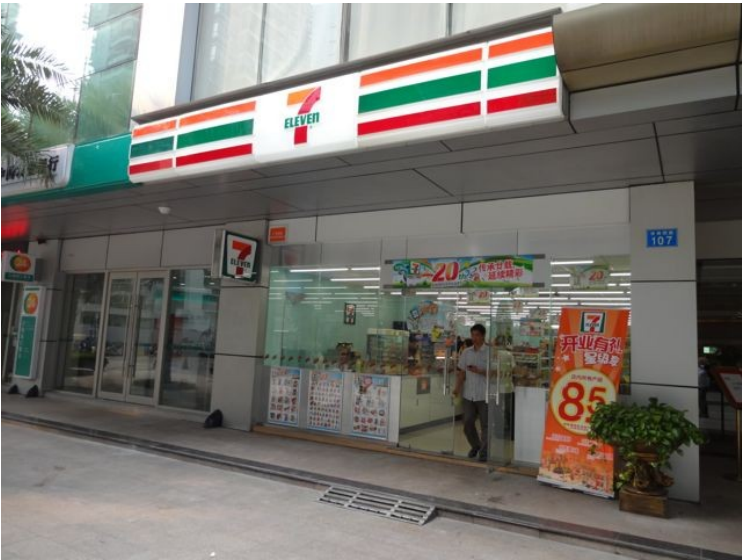
A 7/11 store - at the centre of a cheap labour rort using foreign students. This is the new capitalism

From these few examples, given it is easy to imagine the ease of which labour and products will become global, as will the wage structures, the lower moving toward the higher and higher trending down until there is very little difference. Free trade agreements will provide the setting up of manufacturing or services in any country and by any global employee from any country, meaning that sources of labour will be global and located in any suitable country. At present it is not well known that wages in some industries in America or Japan already approach $7.00 -