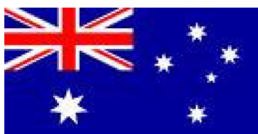
Australian National Flag.