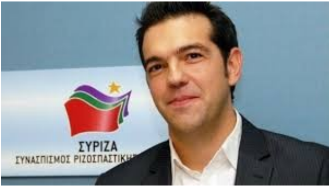
So-called ‘leftist’ Greek PM Tsipras - selling Greece’s assets to the bankers

Then came the collapse resulting in the governments of the day having to load up the taxpayers with debt to save those private bankers. The only reprieve from this iniquity for small Australian business and our farmers and workers, was during the time of the Commonwealth Government Bank which only existed for eleven years of prosperity 1911 to 1924.