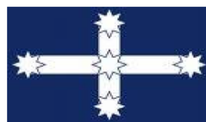
Eureka Flag Or Southern Cross