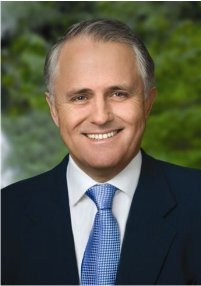
Malcolm Turnbull: an ex banker for Prime Minister

Austerity therefore is a plan not an accident. The whiteanting of workers within Australia has already been allowed to get a foothold, with the labour hire contactors who exploit the migrant workers on farms which supply the big supermarkets. All the while unions are collectively smeared, big corporations will claim immunity, but the contagion will spread. Eventually it will be aligned with the off-shoring of the higher wage earners and thus there will be a meeting of the exploited layers. This may result in a shadow boxing political debate about "budget repair" measures, but the end result will be crushing of the bottom layer of workers by the top-heavy layers to produce lower wages across the board.