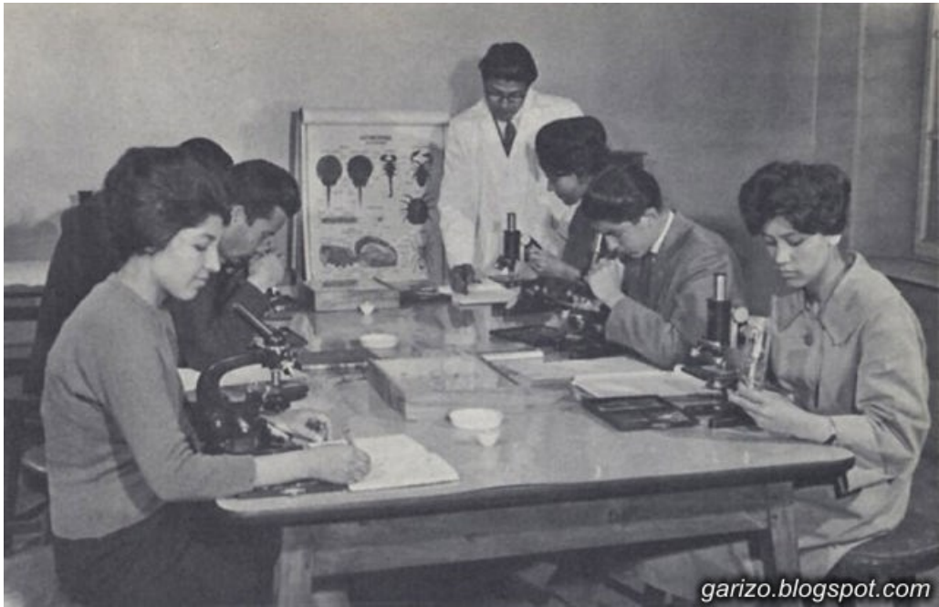
A university in Afghanistan in the 1950's - 'our side' created Islamism through the war with the Soviet Union

The report from the U.K.'s Foreign Affairs Committee confirms that the U.S. and other Western governments exaggerated the human rights threat posed by Libyan leader Muammar Gaddafi and then quickly morphed the "humanitarian" mission into a military invasion that overthrew and killed Gaddafi, leaving behind politi-