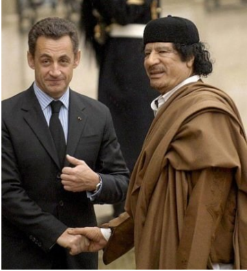
Gaddafi shakes hands with a would-be Gallic coq

We differ with these creatures and remember William Lane's words: Australia is not a sect or a section, it is not a caste or a class, or a creed, it is not to be a Southern England , nor yet another United States. Australia is the whole White