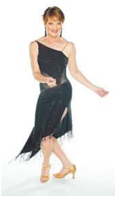
Thank you Dick Smith, cos I wannabee a cel-eb-rity

Perhaps we need to lay down our own rules against all conservatism. We went up our own Mt. Kosciuszko