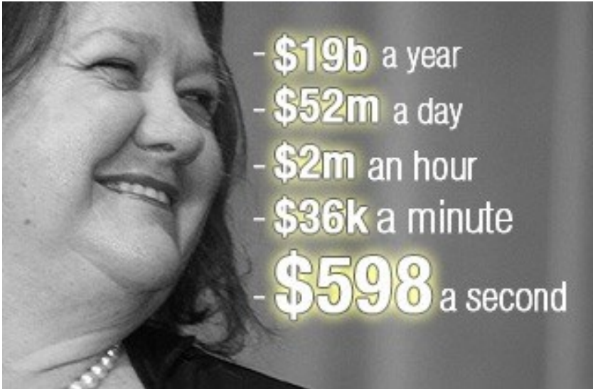
Aspiring Northern (Zone) belle, Ma Barker, looking for 457 'niggers' for its plantation-economy: we plan to make it 'gone with the wind'.