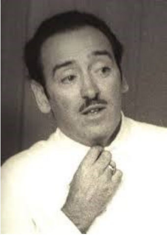
Al Grassby: a key peddler of multiculti helped drug peddlers

It is very likely that this anti free speech law will be repealed and so it should. Note that this is a civil process and has no criminal penalty. That was obviously deliberate.