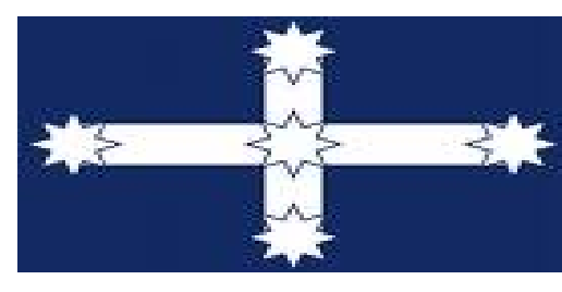
Eureka Flag. Or Southern Cross