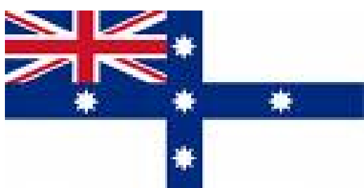
Australian Federation Flag. Australia's First National Flag, 1901-1903